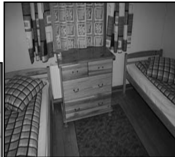
illustration made by Benoit Peyroux